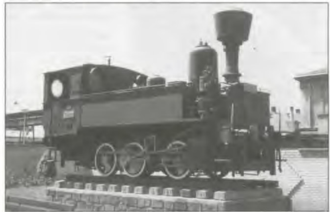
This steam locomotive (type 310.0) represents the first type of locomotive built by Czechs. A sign proclaiming "Na Zdar" was posted on it when it rolled out of a Prague factory in 1900. Visitors will see a model of the train in Czech Technology in Motion.