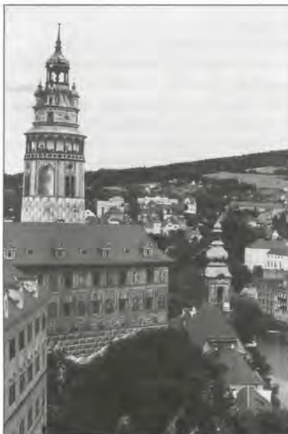
Český Krumlov, Czech Republic.