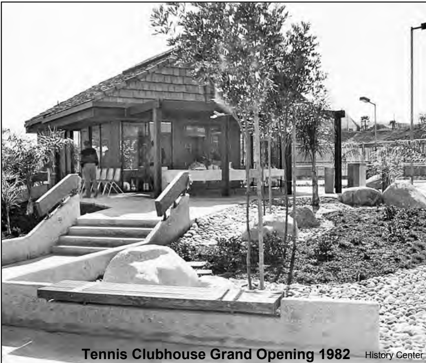
Tennis Clubhouse Grand Opening 1982 History Center

Please mail to History Center, P.O. Box 2220, Laguna Woods, CA 92654-2220 or drop off at our office (next to Laguna Woods Village Library). If you have questions please call 206-0150. Thank you.