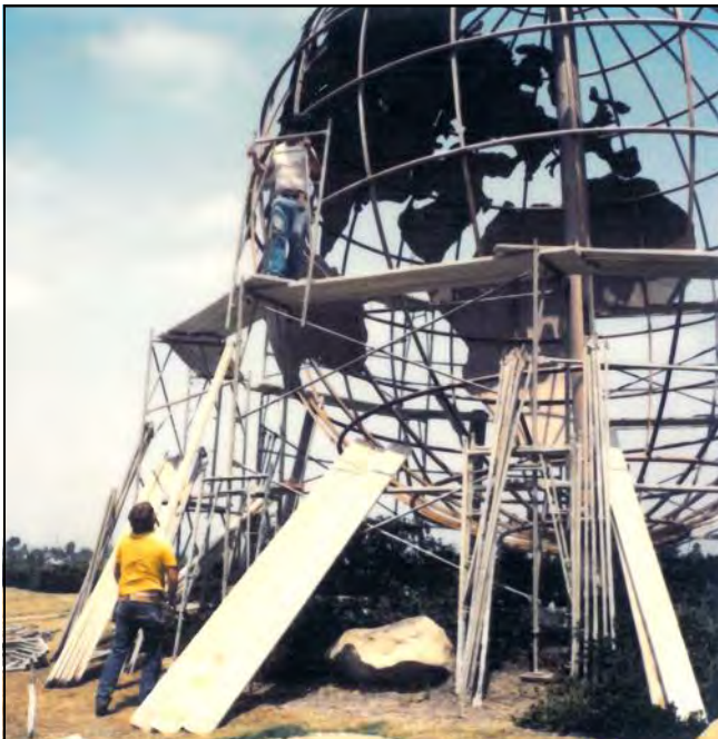
In 1982, the globe was refurbished by Rossmoor prior to transferring title to Orange County. History Center

Many money market accounts were fully liquid—you could withdraw funds at anytime. Other perks were frequently included.