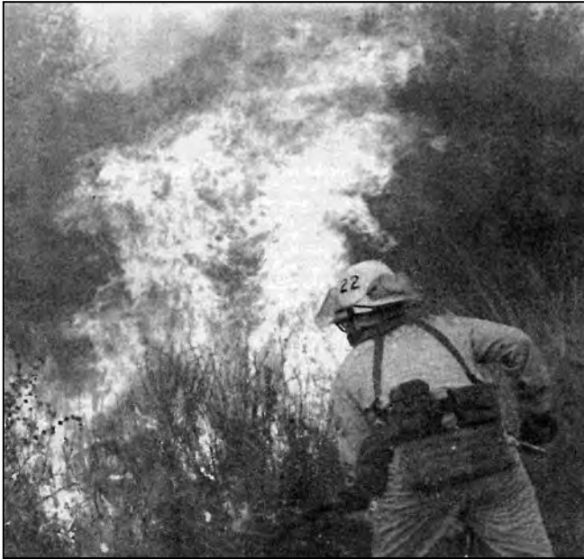
A firefighter from Station 22 battled a fire that came within a mile of the community and sparked allegations that it was caused by a jet's dropped fuel tank. Marine Corps officials denied the claim. Leisure World News

brush fire trucks. It took six hours to control the blaze. No injuries were reported.