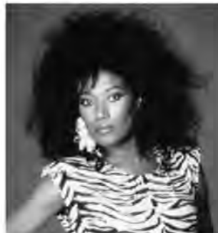
the Legendary BONNIE POINTER of the "Pointer Sisters"

featuring River City Mixed Chorus, Representative of Mayor's Office and Special Guests