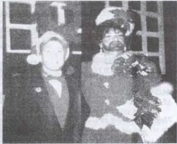
Emperor Matt & Empress And More

The Gayzette hopes that it has included all major contributors to this function. We apologize in advance if you were excluded. It is our intent to acknowledge the many contributions of the community in this endeavor.