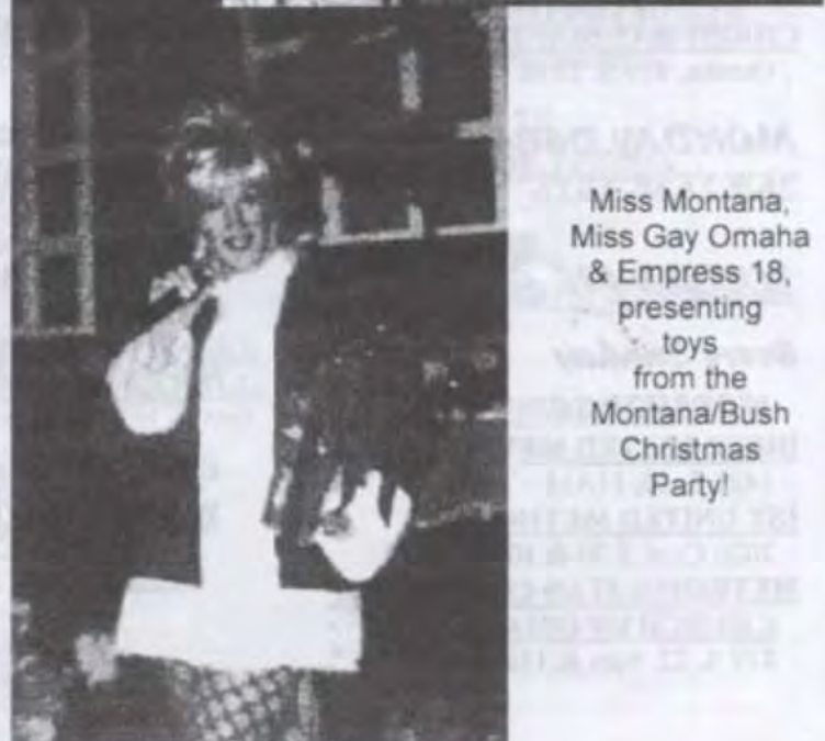
Miss Montana, Miss Gay Omaha & Empress 18, presenting toys from the Montana/Bush Christmas Party!