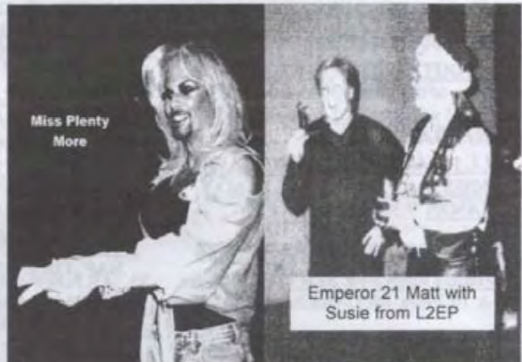
Miss Plenty More