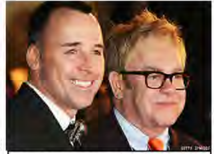
David Furnish (left) with husband

minister Lynne Featherstone is expected to announce the proposal for new legislation, which will benefit thousands of men who were prosecuted for gay sex with someone over 16 during decades when the practice was against the law. Currently, the prosecuted men must disclose the information as part of the program of Criminal Records Bureau checks if they apply to work or volunteer for charities and other organizations.