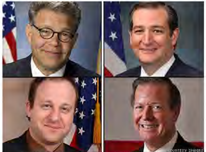
Clockwise from top left: Franken, Cruz, Weber, Polis

It's bad news-good news time in Congress: As right-wing legislators are trying to roll back the rights of same-sex couples, some liberal lawmakers are seeking greater protections for LGBT young people.