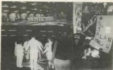
The Galt...Lincoln, ME 1960