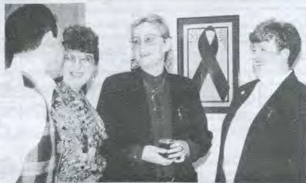
Top: Nebraska AIDS Project has a new home