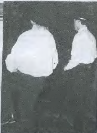
Spur Spinners of Des Moines Strut Their Stuff

DC's was in full swing on the evening of February 4. Black cowboy hats and red bandanas were everywhere as the Heartland Gay Rodeo Association had gathered for their monthly meeting and were now preparing to present a variety show that would benefit the Nebraska AIDS Project.