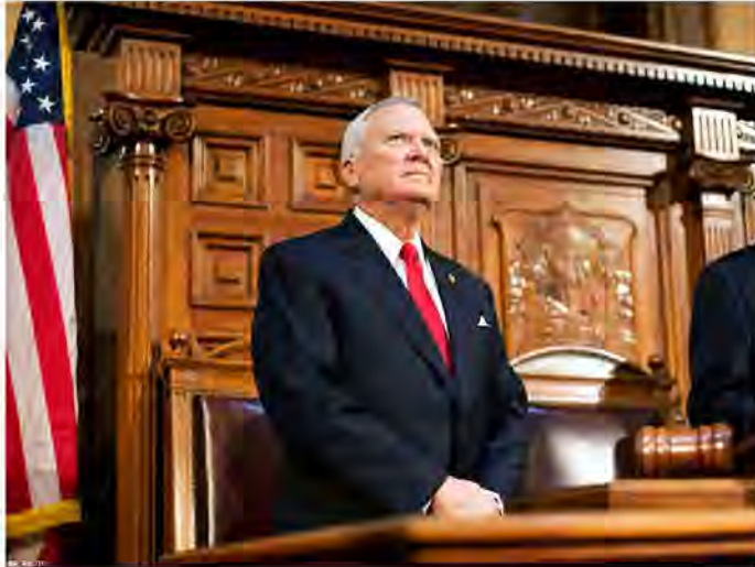
Georgia Gov. Nathan Deal