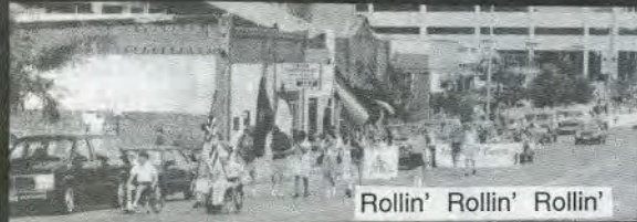
Rollin' Rollin' Rollin'