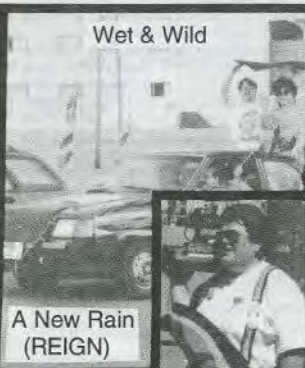
Wet & Wild