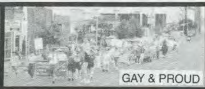
GAY & PROUD