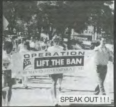
SPEAK OUT !!!