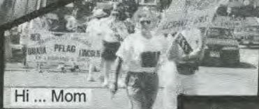
Hi ... Mom