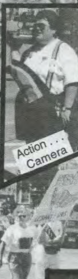
Action . . . Camera