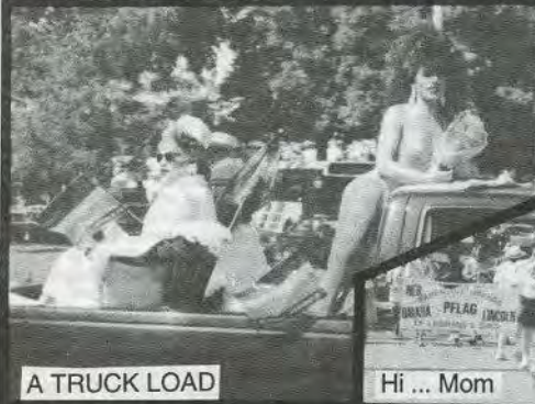
A TRUCK LOAD