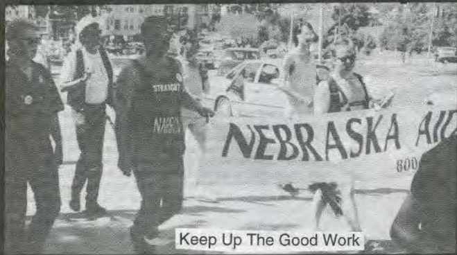
Keep Up The Good Work