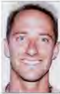
Charles Haddon Spurgeon