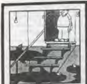
Osgood Fowler's broken sump pump went on to star in "70,000 Leagues Beneath the Basement."

With ALLIED Group's homeowners insurance you'll have protection that covers your needs at some of the lowest competitive rates.