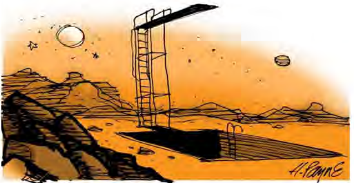
NASA FINDS EVIDENCE OF WATER ON MARS.