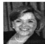
Nurse, Educator, Artist