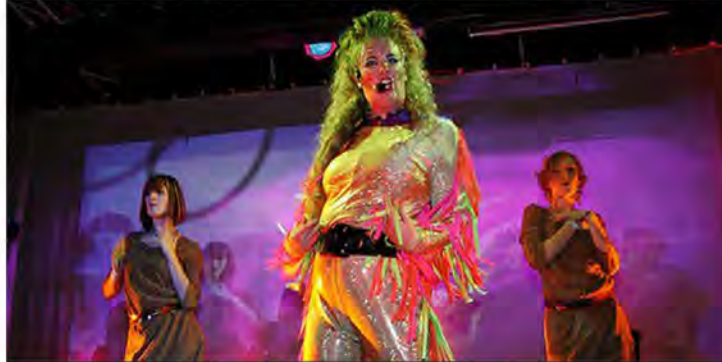
HEADLINER: LESLIE & THE LYS