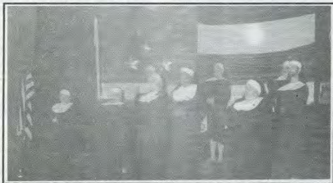
MEATPACKERS AND PACKETTES GET IN THE HABIT