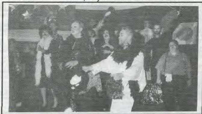
VELVET JOINS THE MEATPACKERS TO TOSS THEIR WIGS IN THE AIR IN GRAND FINALE