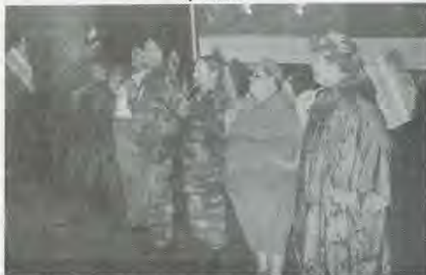
THE MEATPACKERS AND PACKETTES MARCH TO THE CADENCE OF "DON'T ASK, DON'T TELL"

On the 6th of September, we attended the annual Omaha Meatpackers PWA benefit held at the MAX. This show featured many well known community performers as well as several bearded and mustached members of the community strutting their stuff — complete with dazzling and sequined gowns, high heels, and excessively large bosoms. It was Skag Drag at it's best.