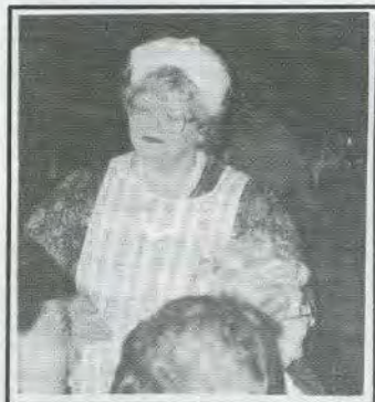
SHARON CAUTIONS DON'T WEAR LEATHER PANTS TO THE SEDER

Special thanks goes to Gary West and the staff and customers of Club 2001 in Lincoln who raised over $1900 for PWA Assistance, and to the Imperial Court of Nebraska for a donation of over $1100 from their Labor Day Raffle.