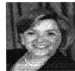
Nurse, Educator, Artist