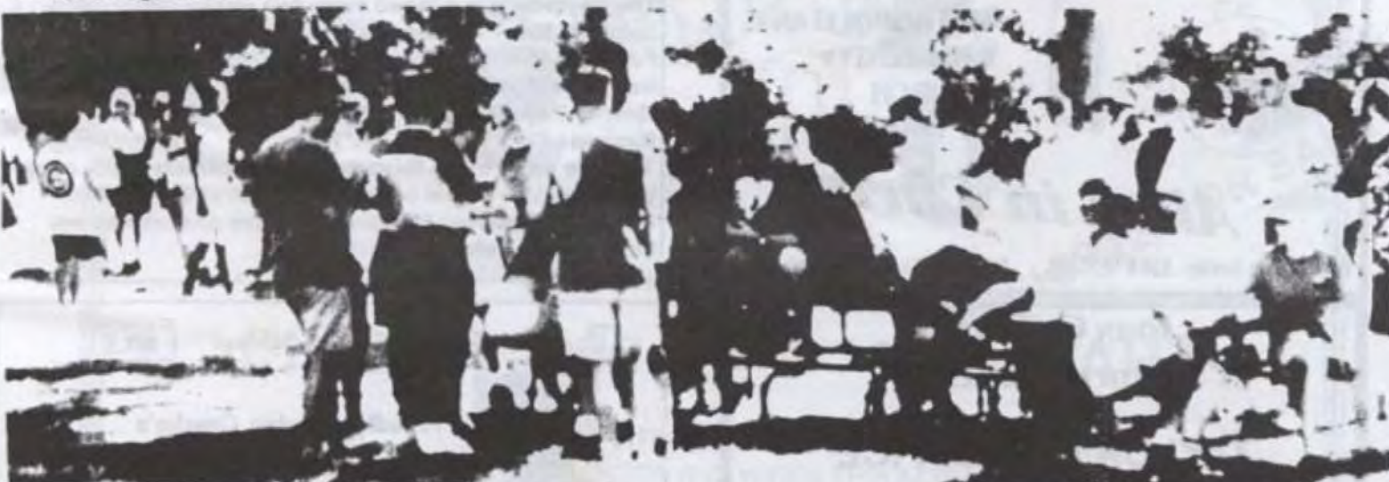
ICON's traditional Memorial Day Picnic attracted 397 people to Vennellyst Park for fun and frolic in the sun