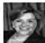
Nurse, Educator, Artist