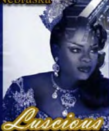
Luscious Miss Gay America 2007