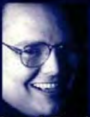
Royal Bush Co-Emcee