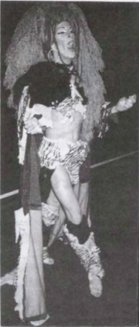
Photo Album...as seen at the Miss Gay Omaha Step-Down Show At the Max Sep. 22 nd .