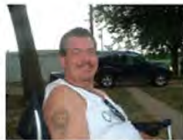
Your Editor in a lighter moment.

beer. Gates for the event open at 1 PM and close at 6 PM. Once again, The MAX will be sponsoring a bus traveling from the bar to the park area. First bus leaves The MAX at 1 PM and the last bus leaves the park at 6 PM.