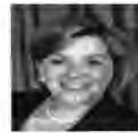
Nurse, Educator, Artist