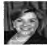
Nurse, Educator, Artist