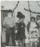
I remember one Halloween party when he showed up dressed as Pope John, complete with blue pipe all over his body and a white ball of cotton glued to his backside.