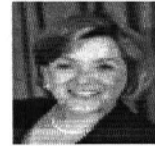
Nurse, Educator, Artist