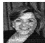
Nurse, Educator, Artist