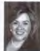
Nurse, Educator, Artist

Eyeliner, Eyebrows, and Full Lip Color The 'Look' You Want With No Downtime 5 Years High Client Satisfaction Nationally Board Certified Exam, FAAM