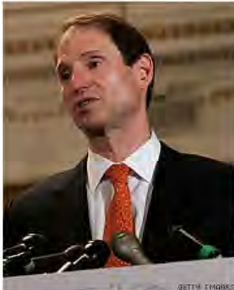
Oregon Senator Ron Wyden

[African Growth and Opportunity Act] will be revoked should the proposed legislation be enacted."