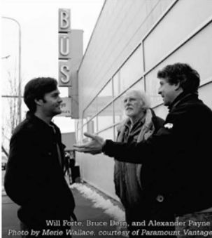
Will Forte, Bruce Dern, and Alexander Payne

Alexander Payne and actors Bruce Dern and Will Forte. Tickets will be available to Film Streams Members on Friday, August 16th and to the general public Friday, August 23rd. Ticket pricing starts at $35, with additional gift levels including pre- and post-party options. All proceeds support Film Streams’ Ruth Sokolof Theater, Omaha’s nonprofit cinema dedicated to enhancing the cultural environment through the presentation and discussion of film as an art form.