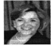
Nurse, Educator, Artist