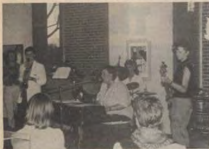
AMETHYST PERFORMED AS PART OF BOTH WESLEYAN & UNL'S WOMEN'S WEEK.