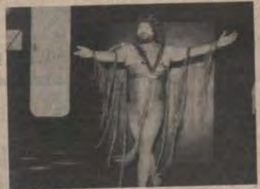
Don Flowers displays fancy wraps at the Max Show.