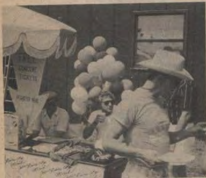
River City Mixed Chorus Booth