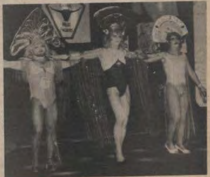
Omaha Meatpackers perform at the Max.