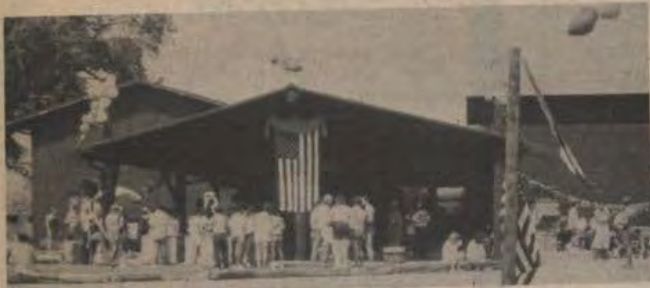
Balloons flourished at the Carter Lake Warehouse.