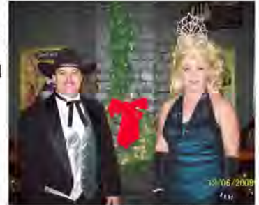
(Continued on page 6)