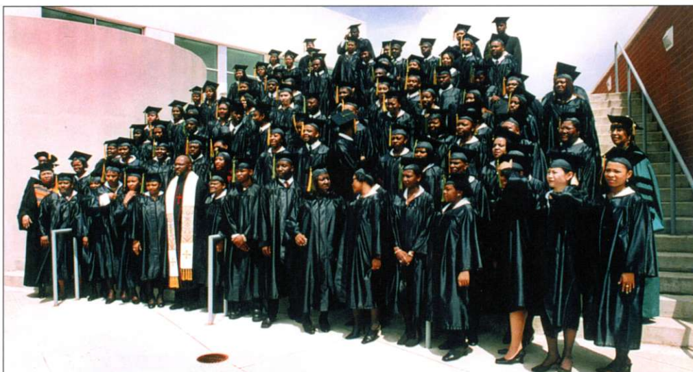
The 2002 Graduating Class of Philander Smith College pose with the honorees.