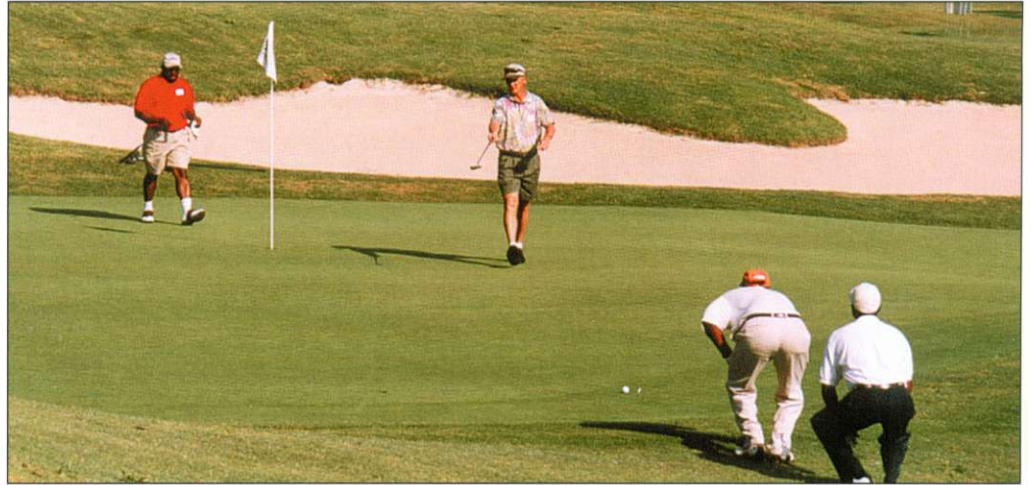
Tournament participants work together to line up a putt.

The tournament at Rebsamen Golf Course fielded 22 teams and raised approximately $25,000 for Philander Smith College.