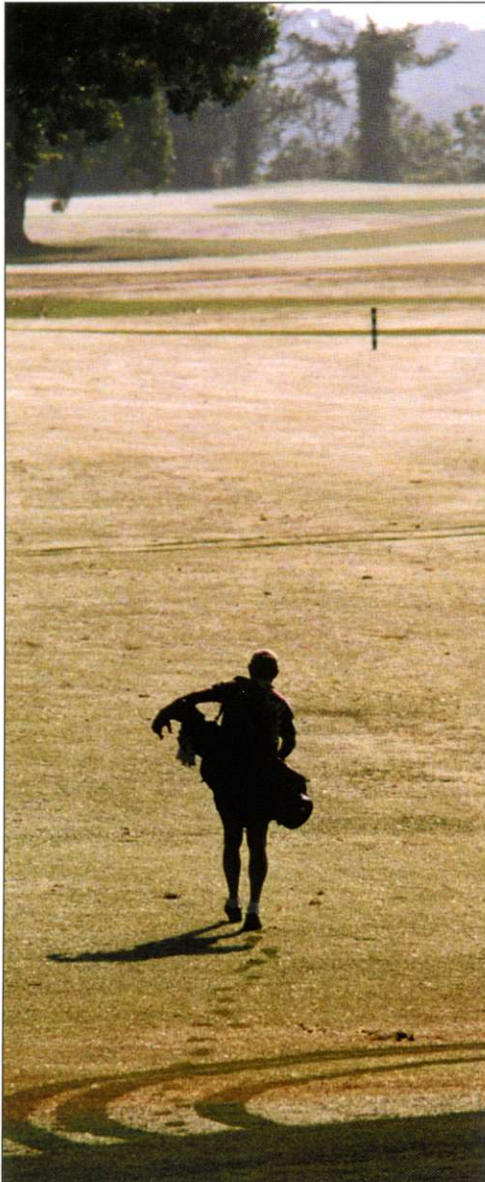
A lone golfer heads out on the course.