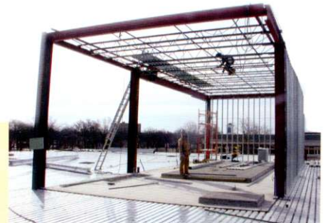
Workers walk the beams on the frame of a utility room atop the ongoing construction of the Kendall Science and Health Mission Center. (photos and story on back cover)

Echoes of Excellence is published semi-annually with news from the Office of The President of Philander Smith College.