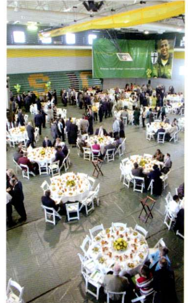
More than 500 people gather for the Annual Katherine P. Mitchell Scholarship Fund President's Luncheon, an event that raised more than $100,000 for the scholarship fund. (page 7)

Kendall Science and Health Mission Center (back cover)