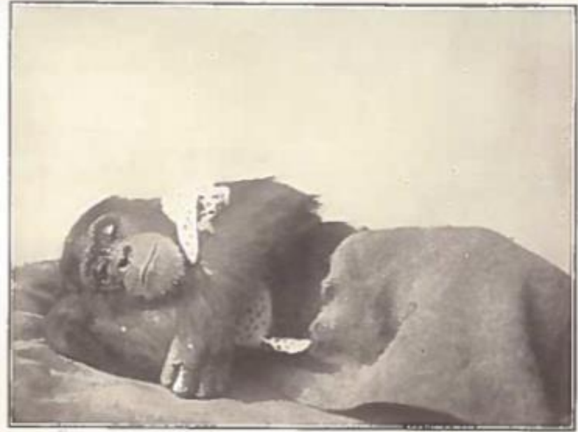
... and takes the toy to bed with her.