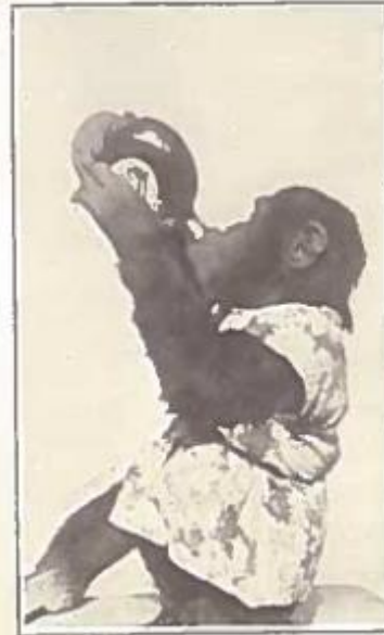
The last drop.