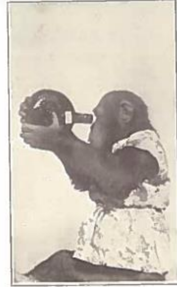
Was it really the last drop?