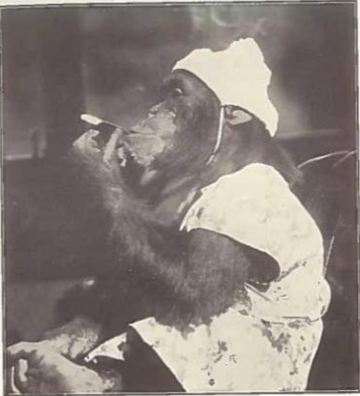
I let her light up and enjoy a few puffs.