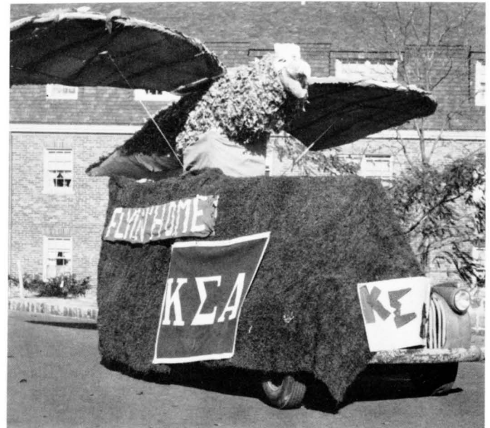
Here's hoping all you Seahawks fly home on Homecoming Day.