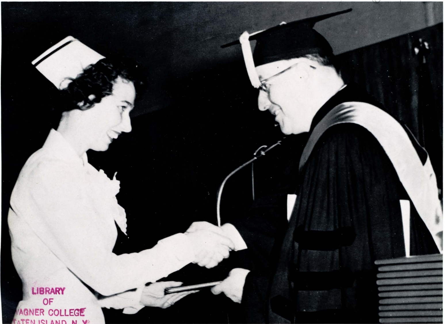
LIBRARY OF WAGNER COLLEGE STATEN ISLAND, N. Y.