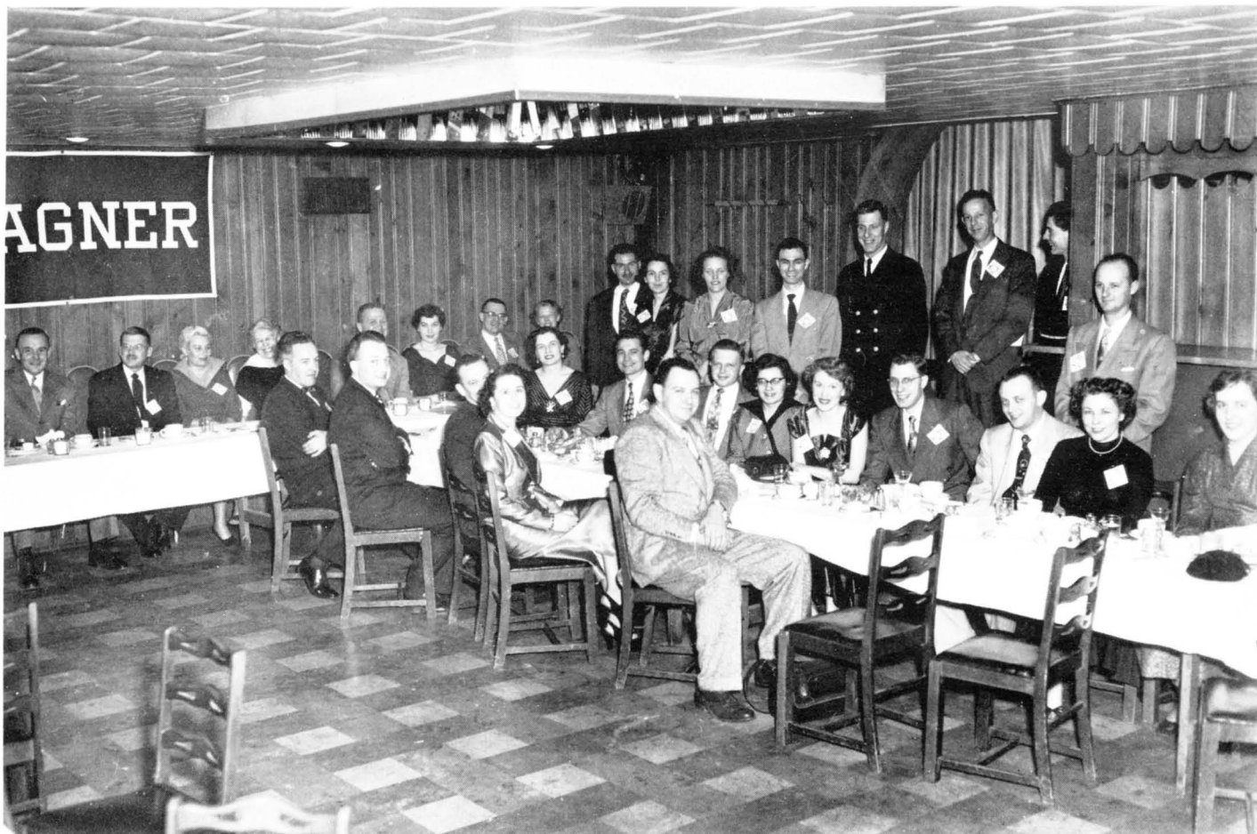
The Northern New Jersey alumni at their chapter dinner in Teaneck on March 7.