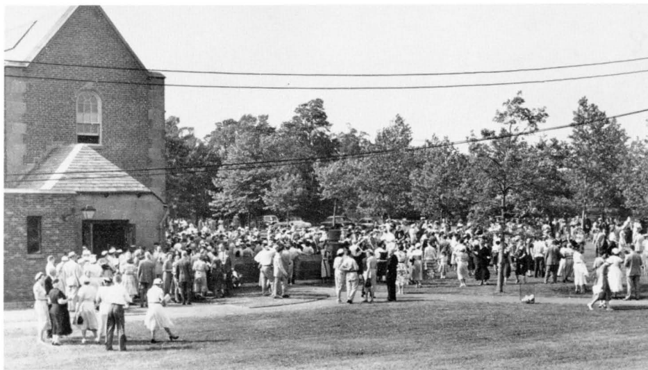
Are you in this picture? It's one of the crowd in front of the gym after graduation exercises.