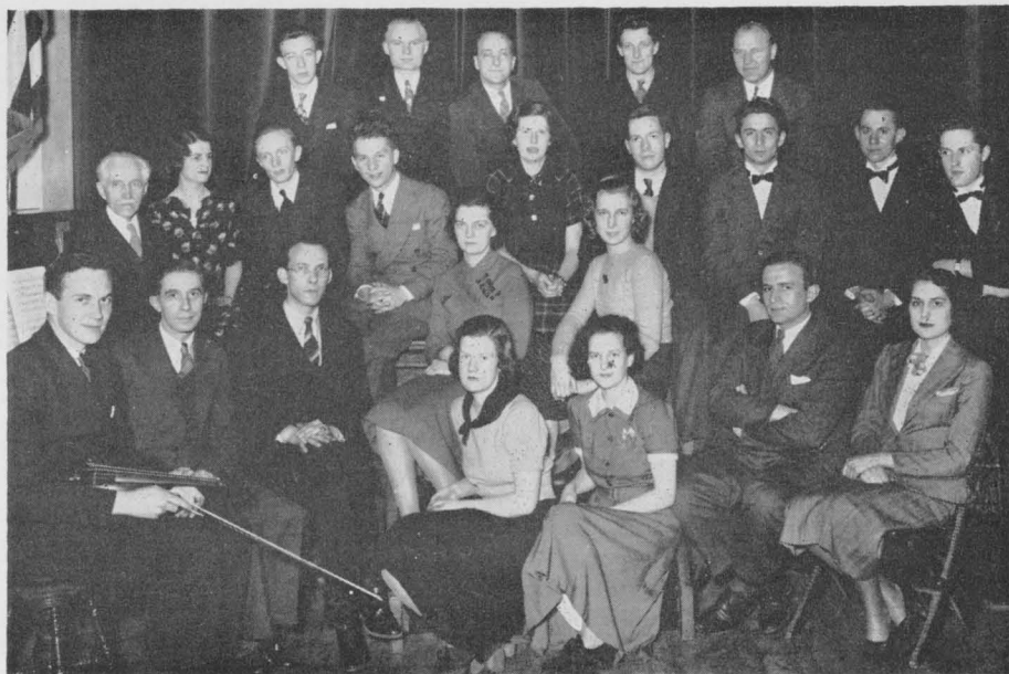
THE MUSIC CLUB OF 1938-39