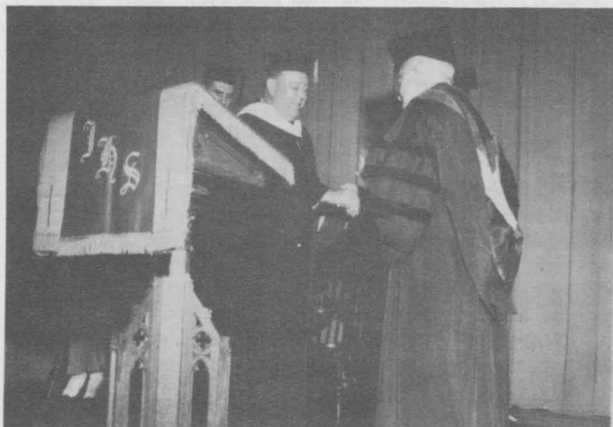
Name in the News

There were 113 new contributors, and 118 1949 contributors who did not respond to the 1950 appeal.