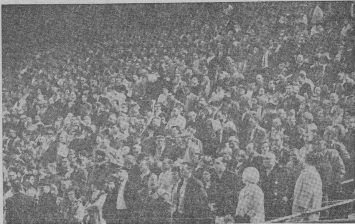
Part of record 8,256 persons in the crowd Saturday night.