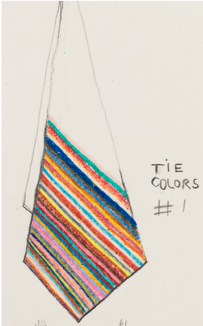
Tie Colors #1 , 1961, Jim Dine American, born 1935 Colored pencil on paper 11 x 8 1/2 in. © Jim Dine

Brave Eagle , 1979 Alden Mason, American born 1919 Acrylic on canvas 84 x 79 in. Gift of Safeco Insurance, a member of the Liberty Mutual Group, and Washington Art Consortium 2010.31.11