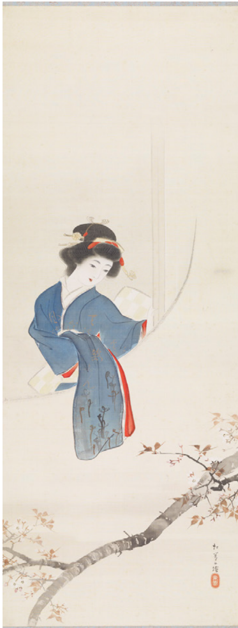
Beauty at Round Window Uemura Shoen, 1875-1949 Ink and color on silk 79 1/2 x 24 in.