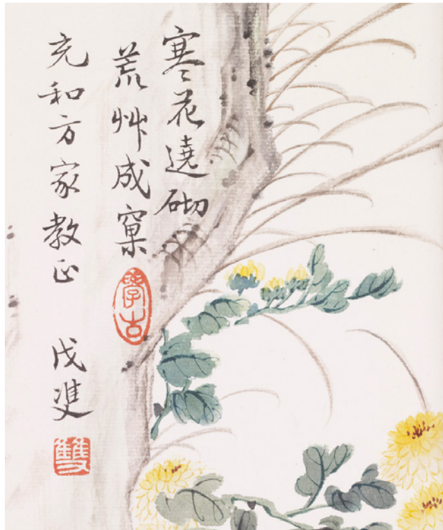
Quren Hongzhao album 1930-80s Chinese, multiple artists Ink and color on paper 6 1/2 x 3 3/4 in.

Seattle Art Museum's permanent collection was enlarged and enhanced by the addition of 255 works of art. Many were generous gifts of individuals and bequests, others were given by corporate friends, and some were museum purchases. We are grateful to our donors for their vision in helping to make Seattle Art Museum a vibrant part of the community and a leading art institution in the Northwest. Their gifts enrich not only our collection but the lives of all who visit SAM.