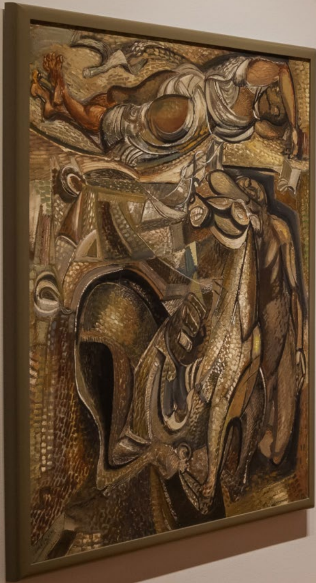
MODERNISM IN THE PACIFIC NORTHWEST: THE MYTHIC AND THE MYSTICAL June 19–September 7, 2014

“WHAT A TREASURE TROVE! THE SEATTLE ART MUSEUM’S BIG SUMMER SHOW, MODERNISM IN THE PACIFIC NORTHWEST: THE MYTHIC AND THE MYSTICAL , GIVES A GRAND OVERVIEW OF ARTWORK CREATED IN OUR REGION FROM THE 1930S FORWARD”