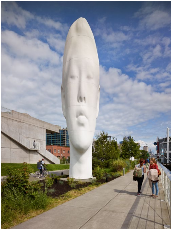
Echo 2011 Jaume Plensa Spanish, born 1955 Polyester resin, marble dust, steel framework Height: 45 ft. 11 in.; footprint at base: 10 ft. 8 in. x 7 ft. 1 in.; gross weight: 13,118 lbs. Barney A. Ebsworth Collection

Sparky and Cowboy (Gary Rogues), Schererville, Indiana 1965/later Danny Lyon American, born 1942 Silver gelatin print 11 x 14 in. Gift of Philip A. Bernstein 2013.28.26