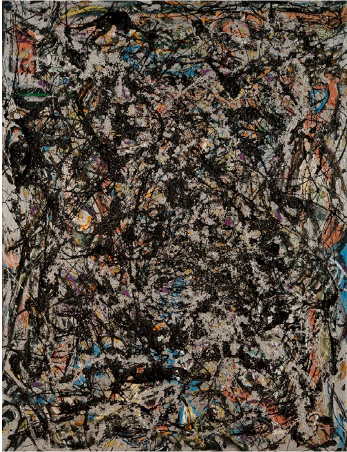
Sea Change 1947 Jackson Pollock American, 1912-1956 Artist and commercial oil paint, with gravel, on canvas 57 7/8 x 44 1/8 in. Seattle Art Museum, Gift of Signora Peggy Guggenheim, 58.55

This year saw SAM conservation working on major grant-funded projects including Jackson Pollock's Sea Change , which was conserved thanks to a generous grant from Bank of America. We were also delighted to receive an award from the Sumitomo Foundation, enabling treatment of the Japanese Nambokucho Period painting Scenes from the Life of Gensei Shōnin .