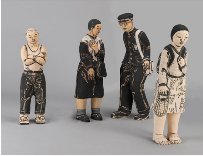
Middle Aged Man, Woman with Handbag, Girl in Deer Dress, Male Student 1999