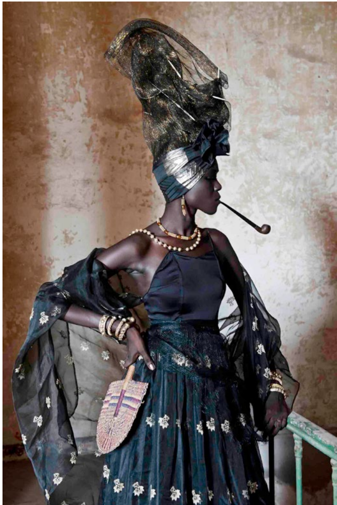
Signare #1, île de Gorée 2011 Fabrice Monteiro Belgian/Benin, works in Senegal, born 1972 Archival digital print 47 1/4 x 31 1/2 in. Gift of the African Art Council and African Art Acquisition Fund