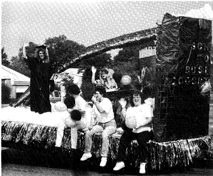
School of Business Homecoming Parade entry