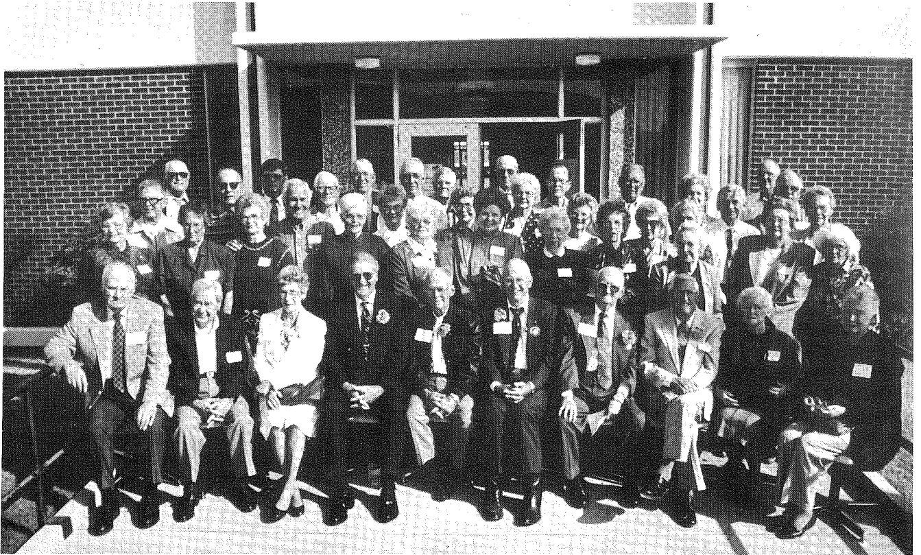
Group attending the "40s Era and Beyond" Junior College Reunion at Homecoming '92