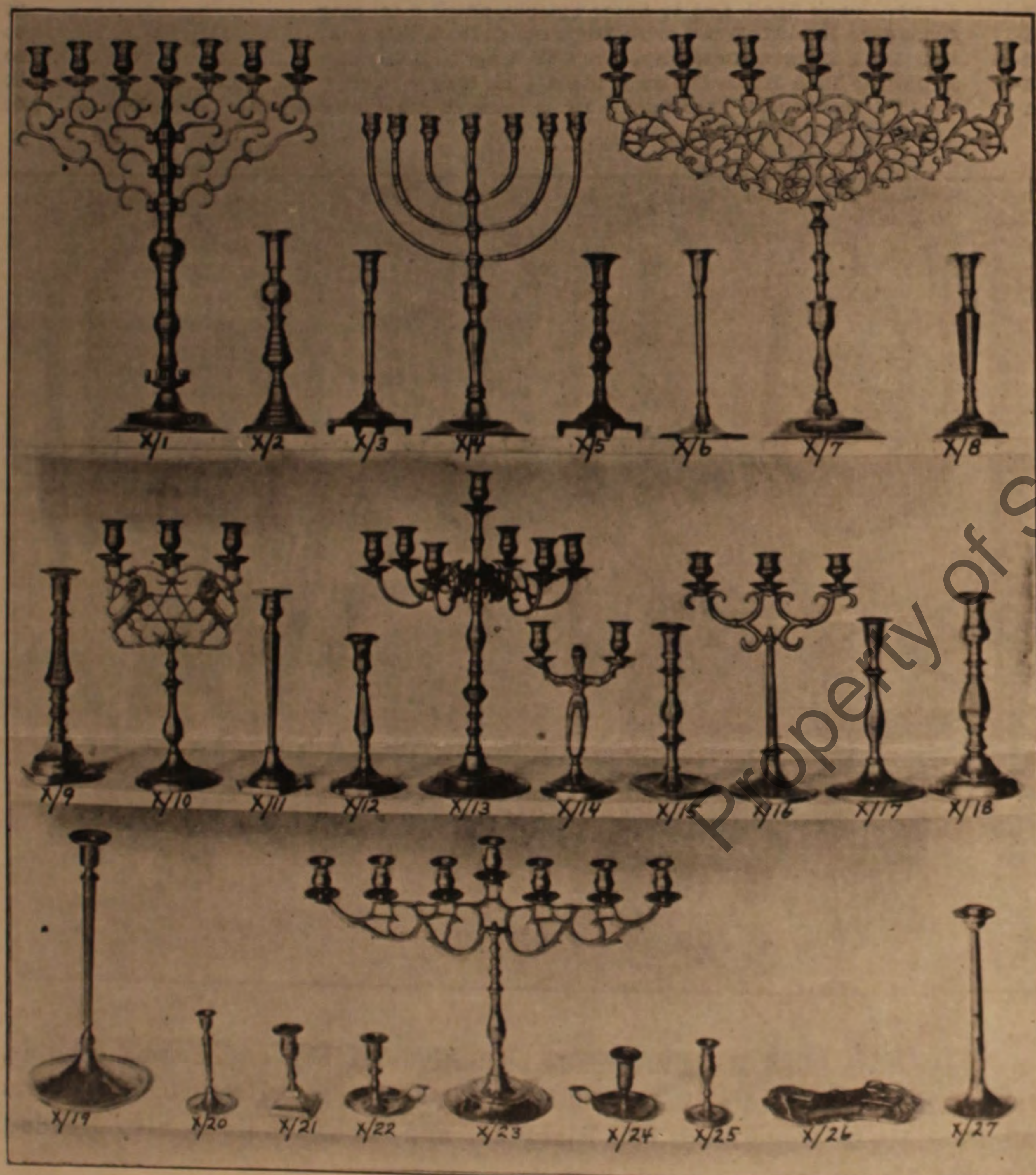
For Description and Prices See Opposite Page

For a Wedding Gift or Holiday Present, there is no decoration for a home that is as rich, useful and substantial as Brass Candle Sticks or Candelabras. These are all hand made of Solid Brass and Finest Russian Workmanship. No. X-4 is a replica of the ancient Biblical 7 Pronged Candle Stick.