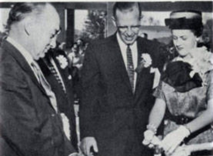
Miss City Beautiful—shown here cutting the ribbon at the opening of a new store—helps dramatize the work of the Commission.