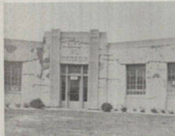
BEFORE—This time-worn City Service Station was a challenge to the Spring Clean-Up Campaign.