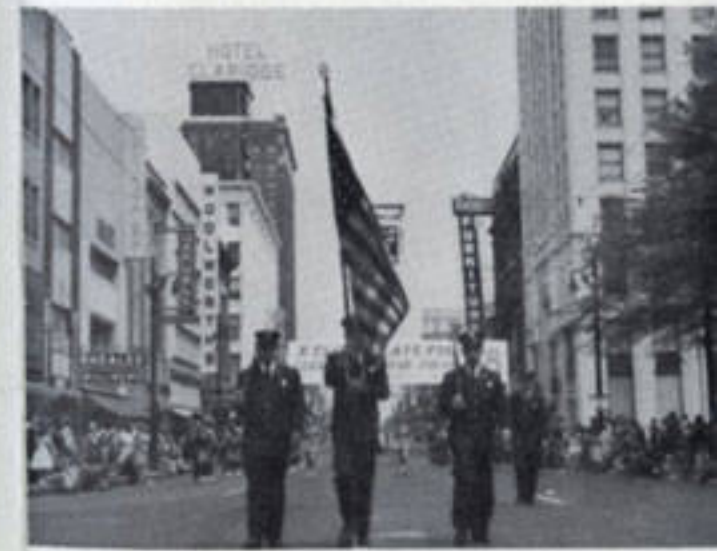
All Memphis turns out for the mile-long Clean-Up parade, a highlight of the annual Clean-Up Campaign.