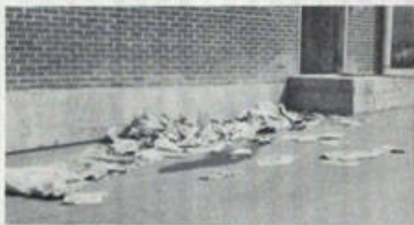
BEFORE—Litter and garbage made an eyesore of this parking area.