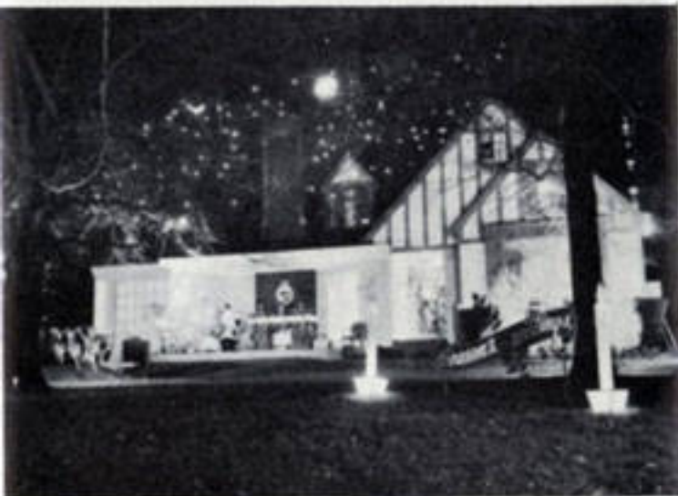
Illuminated displays like this one make Memphis a fairyland during the Commission-sponsored Outdoor Christmas Lights competition.

The success of a city-wide program of cleanliness and beautification depends ultimately on the response of the individual citizen. In a sense, the City Beautiful Commission is the "spear-head"—arousing citizens and spurring them on to greater efforts. To awaken Memphians to their responsibilities, the City Beautiful Commission throws a spotlight on its activities via such city-wide events as the selection of "Miss City Beautiful" during the annual Cleanup Campaign. The selection of this personable young lady and her subsequent trip to the nation's capitol are recorded fully in the local newspapers and serve to dramatize the work of the Commission.