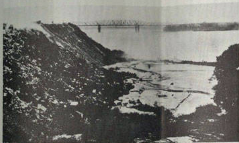
BEFORE—This was the Memphis waterfront before public-spirited Memphis women launched their beautification campaign.