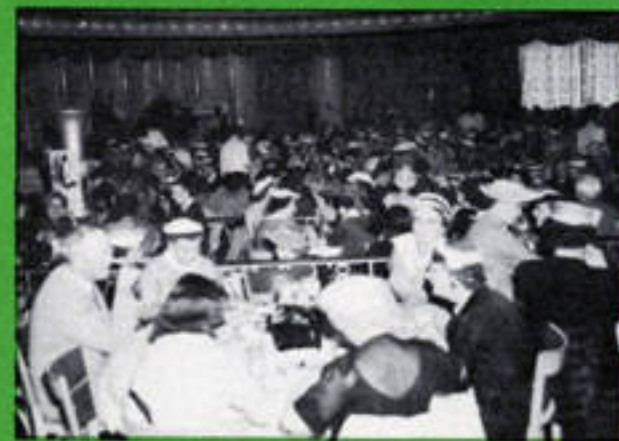
Hundreds attend the annual luncheon, launching the Clean-Up Campaign.