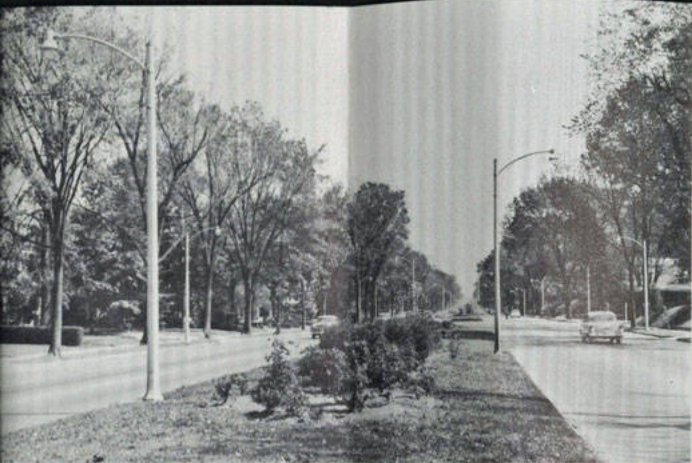
This beautiful tree-shaded thoroughfare is an outstanding example of the planned landscaping promoted throughout Memphis by the Commission.