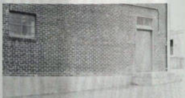
AFTER—Following a Commission inspection, trash and litter were cleared.