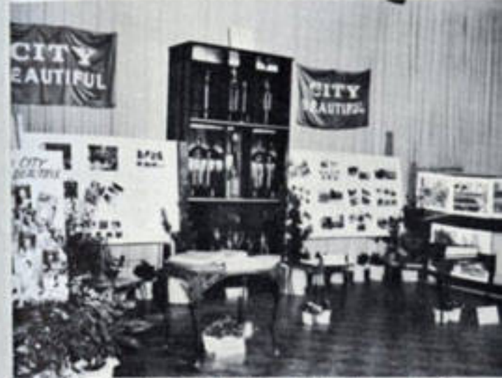
Visitors to the Mid-South Fair learn of Commission activities at the City Beautiful Commission booth.

To encourage cleanliness, the Commission offers a special service to citizens at no extra cost to the taxpayer. Special pickups of brush, trash, leaves and grass are made when requested by telephone. This is in addition to regular garbage and trash pickups, and it helps to cut down on fall fires.