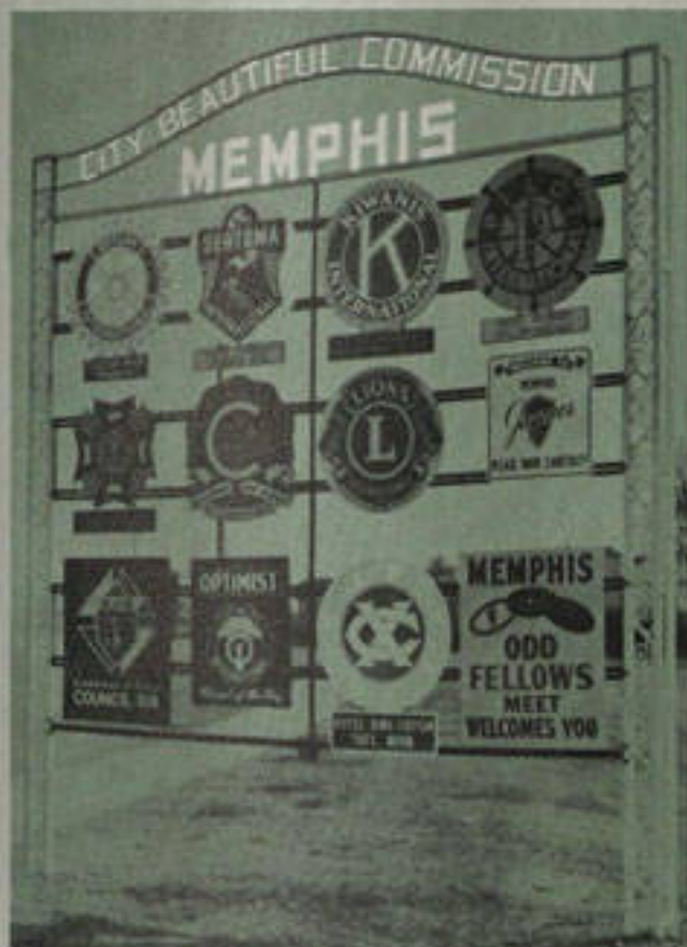
Visitors to Memphis are greeted by this impressive roster of service luncheon clubs—a beautification project of the Commission.