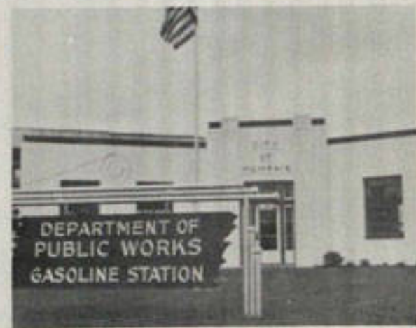
AFTER—With a fresh coat of paint and repairs, the building emerged shining and ready for business.