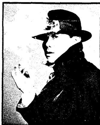
Yellow Fever from Pan Asian Repertory Theatre (March 11)

Potluck and Slide Show: Asian Lesbians Past and Present at Karin's 182 Highland Ave. #5 Somerville. (625-0670) This slide show produced by Asian Lesbians of the East Coast of New York (ALOE) is a global survey of Asian lesbianism. Geographical areas include India, Japan, China and others. There are five sections to the program: 1) Sex segregation sisterhood, 2) Dildo, 3) Goddess and Woman Warrior 4) Political activist, feminist and writer 5) Asian lesbians in the United States. The show runs 30-45 minutes. It has been shown once before in Boston and is being brought back by BAGMAL due to popular demand. (Directions: Red Line to Davis Square, exit onto Highland Ave., walk up Highland Ave. about 10-15 minutes. Landmark: after Little Sisters of the Poor - a nursing home.) Donations: $3 to benefit East Coast Asian Lesbian Retreat/Conference in summer 1988. For more information call Jack Lo 547-8647.