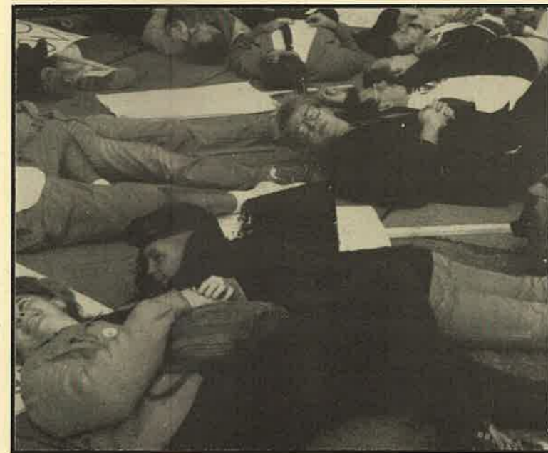
Spring 1988: AAN! staged a die-in to protest the lack of federal policies on AIDS

Members of AAN! hold meetings with government officials, formulate policies, give press interviews, prepare briefs, raise money, write articles, produce radio shows, plays, videos and cable TV programs. We speak to local groups, organize information sessions, participate in national and provincial AIDS coalitions. We also type minutes, write letters, stick on labels and make phone calls—all the day-to-day activities that keep an organization like ours vibrant and effective.