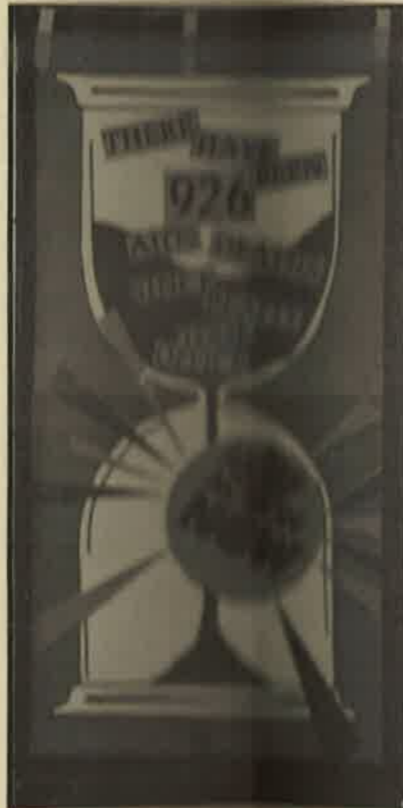
March 1990: Calculating the cost of federal inaction

With the development of new treatments, AIDS and HIV infection are becoming chronic manageable illnesses. We do not believe that AIDS is an inevitable death sentence.