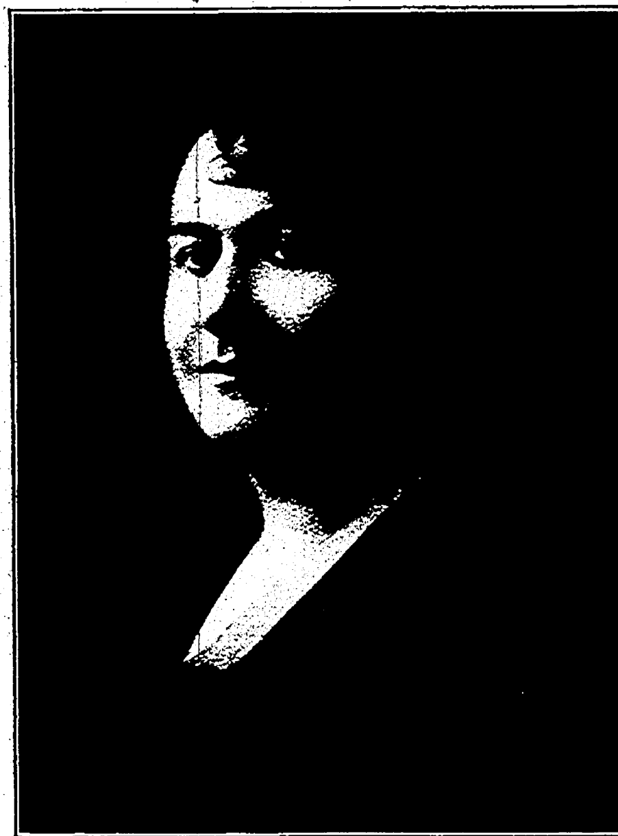
DR. PAULINA LUISI.

committed and could continue. He was proud to say that in their own country men had taken the matter up without waiting to be pressed to do so by women, and they had good reasons to hope that before long all the absurd inequalities would have disappeared from their laws, and women would enjoy full rights. This was the more honourable to their country, since in the few countries where women had won recognition of their rights, this had not come about through a spontaneous desire on the part of men to make reparation, but after a long, painful, and tenacious fight. If the French Revolution had resulted in the recognition of the rights of man, the great war just terminated would give rise to the universal recognition of the rights of women—that was to say, of the equal rights of all human beings.